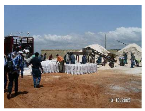
Salt producer applying simple machinery for iodisation, Ghana R. Yusufali, MI 2005

Other observations were that equipment support was not backed up by on site training in the use and maintenance of the equipment, and there was a lack of spares and parts for regular service and of follow-up support. In a few cases, equipment support has also included cement mixers and drum mixers, these units are not designed for use with salt and corrode quickly or require too much effort in iodizing salt in terms of excessive handling.