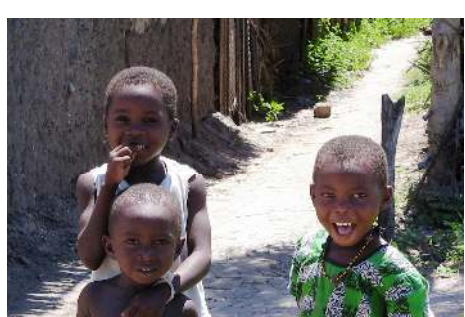
Children playing, Mpwapwa, Tanzania

Over 330 million people remain at continued risk of Iodine Deficiency Disorders (IDD) in Africa. The spectrum of Iodine Deficiency Disorders including cognitive and mental impairment can be prevented by sufficient intake of iodine through the diet. Iodisation of salt has been proven to be the most effective strategy to provide populations with iodine and prevent IDD. Iodizing all salt can prevent more than 12 million cases of mental impairment in infants annually.