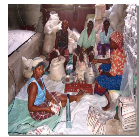
Group of women filling salt, Matola, Mozambique Claire Sita, MI 2006

Business services training offered can cover a range of topics including microfinance, branding to differentiate between iodized salt and low quality non iodized salt, proper packaging and labeling (currently uncommon) all of which can have an impact on the final selling price and hence profitability.