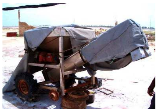
lodisation unit remaining idle for more than a year, Senegal

One size fits all' units in any process industry do not work and closer attention has to be paid in designing and providing equipment so that it integrates with the operations and does not result in the salt producers having to bear excessive costs and undertake extra handling of salt.