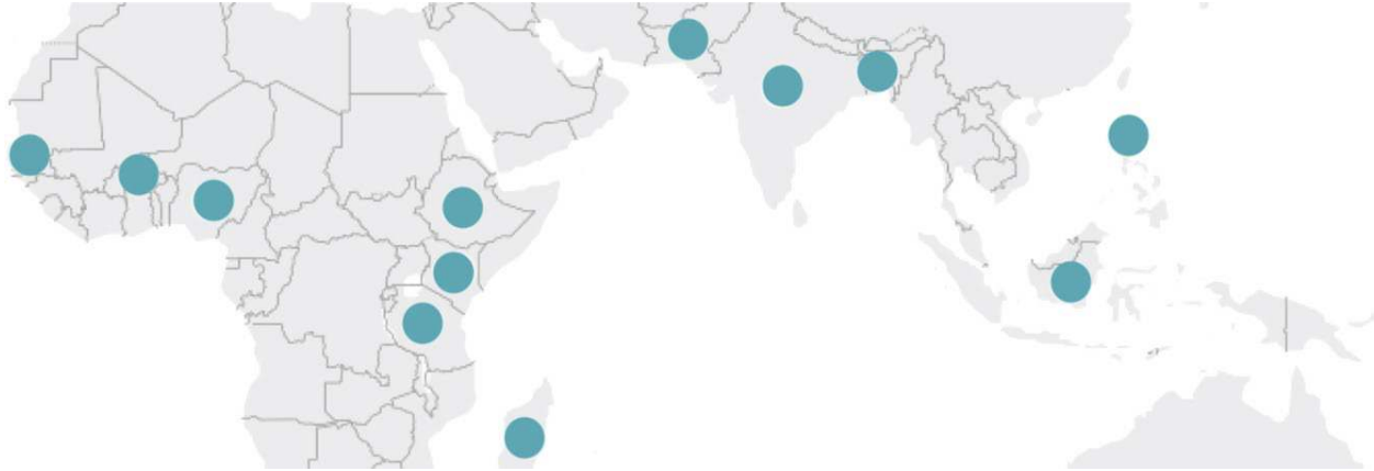
Figure 1: 12 countries included in this analysis are Bangladesh, India, Pakistan, Philippines, Indonesia, Burkina Faso, Ethiopia, Madagascar, Nigeria, Kenya, Senegal, Tanzania

The key assumptions in the cost-effectiveness analysis include: