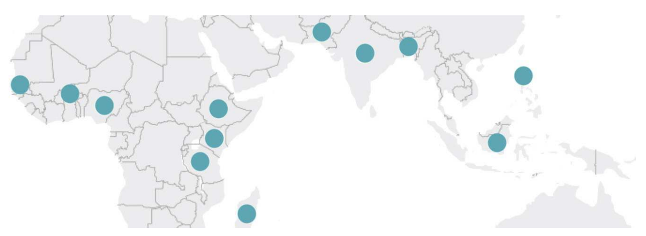
Figure 1: 12 countries included in this analysis are Bangladesh, India, Pakistan, Philippines, Indonesia, Burkina Faso, Ethiopia, Madagascar, Nigeria, Kenya, Senegal, Tanzania

The key assumptions in the cost-effectiveness analysis include: